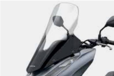
WINDSCREEN 08R70-K1Y-D10 The Windscreen improves the comfort of the rider and adds the final touch to the design of the PCX125.