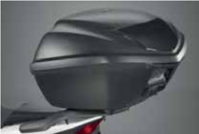
35L TOP BOX KIT 08ESY-K1Z-35TB 35-litres plastic Top Box with a backrest that can store 1 helmet. Top box base and key system included.